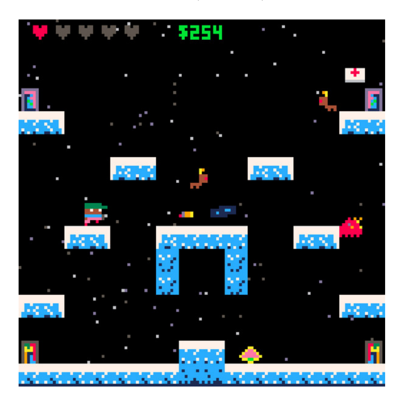
Get Dis Money Free Download [key]

Download ->->-> <a href="http://bit.ly/2JWwR6Y">http://bit.ly/2JWwR6Y</a>